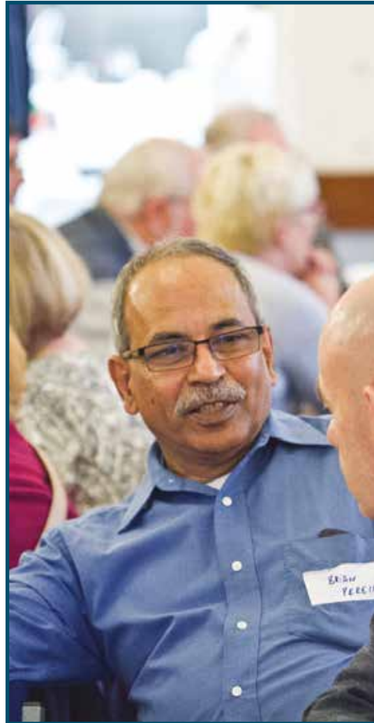
The consultation event at Gateshead Masonic Hall

Attendees had the opportunity to ask questions or gain clarity on any aspect of the proposals, and workshops enabled discussions with feedback fed into the council consultation as part of the Healthwatch Gateshead report which summarised the concerns raised by residents, carers and stakeholders.