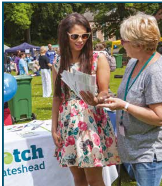
Giving advice at the Party in the Park at Saltwell Park during Carers' Week.