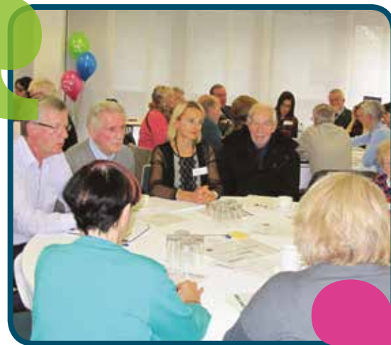
Healthwatch Gateshead's first annual event in November 2014.

Feedback received about a wide range of services has helped us identify issues which are of concern to patients to focus our work on.